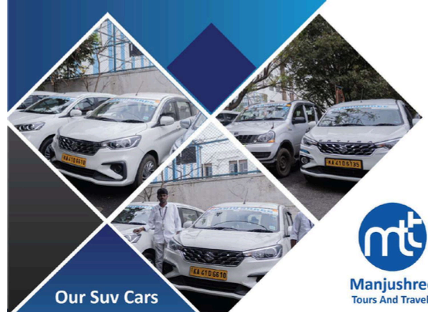
Our Suv Cars