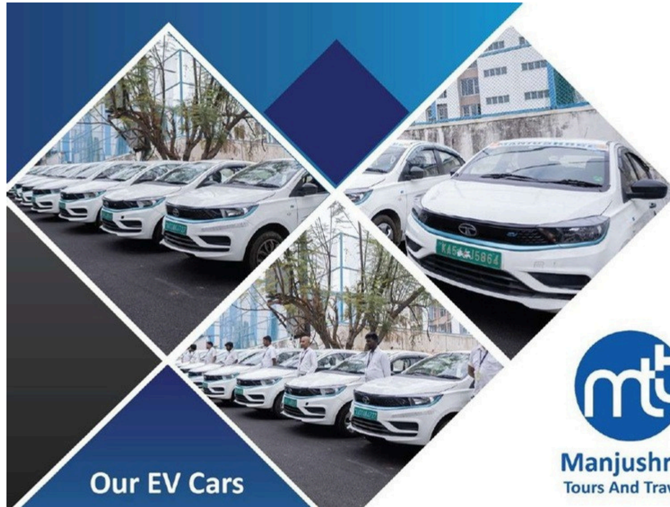
Our EV Cars