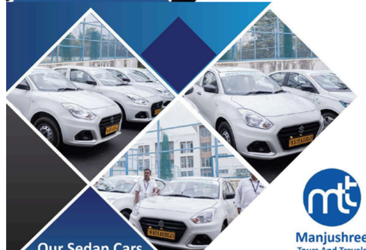
Our Sedan Cars